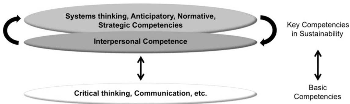
Fig. 3 A layered set of competencies in academic sustainability education, linking basic competencies and key competencies in sustainability, as well as recognizing interpersonal competence as cross-cutting key competence in sustainability

Students might be overwhelmed by the call to acquire all of these competencies: four individual key sustainability competencies, the fifth crosscutting key competence (interpersonal), “regular” academic or basic competencies, and the overarching sustainability research and problem-solving competence. Does each student need to acquire all competencies? As in any other field, it is advisable to strike a balance between specialization and generalization. Considering limited time and capacity, it seems reasonable that students would acquire in-depth expertise in one or two of the key competencies and a solid grounding in the others. The sufficient level of rigor also depends on the level of the academic program. Undergraduate, masters, and doctoral students ought to fulfill different requirements. However, it will still take a considerable amount of time to consolidate these standards across different universities, programs, and communities, which is imperative for establishing the sustainability field in the academic landscape and beyond. In addition, discussions on new teaching formats need to accompany this consolidation process. One might argue for a stronger emphasis on the expertise of teams in which team members complement each other’s competencies. This concept has been discussed in educational contexts, for instance, as “distributed expertise” (Salomon 1993) but is still challenged by overemphasis on individual CVs and expertise.